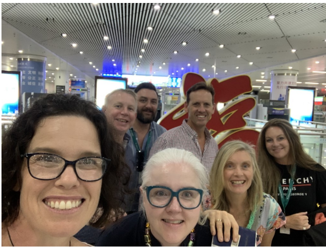
Shenzhen High Speed Train Station

Taking a trip to Shenzhen from Hong Kong is a mere 14 minute high speed train journey, with speeds reaching 198km/hr. The sales team spent the day in Shenzhen meeting with the Cathay team there, admiring the ultra-modern city and office. With over 86 million people in the Greater Bay Area it is an important part of Cathay Pacific's market.