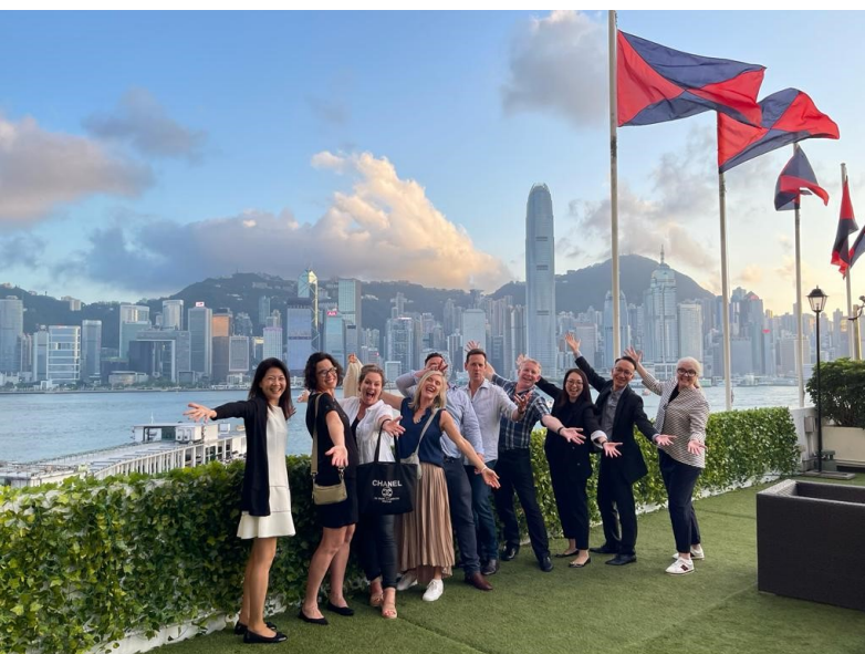
With the Sales team from Marco Polo Hong Kong Hotel

The Trade Sales Managers from Australia and New Zealand recently visited Hong Kong and Shenzhen. For most of us it was our first trip back on Cathay Pacific and to Hong Kong since 2019!