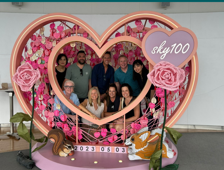
With the Sales team from Sky100 Observation Deck