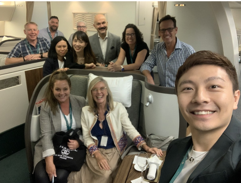
First Class Training Mock-up

The Trade Sales Managers spent a day at Cathay City and Hong Kong International Airport hearing about the changes and innovations that have been made over the last few years. Our airport tour included the inter-modal area where passengers can connect airside to the ferries that operate direct from the airport to Macau and the Greater Bay Area of Mainland China such as Shenzhen and Guangzhou. We saw the new Sky Bridge connecting T1 to the satellite concourse – the worlds longest airside bridge which allows an A380 to pass underneath. We also spent some time with our Customer Experience Team visiting the training mock up of the newly relaunched First Class product.