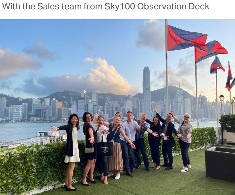
With the Sales team from Sky100 Observation Deck

Our last day was spent exploring Central and the Mid-Levels, experiencing the newly renovated Peak Tram and then walking down through Hollywood Road, complete with a stop for won ton noodle soup and egg tarts.