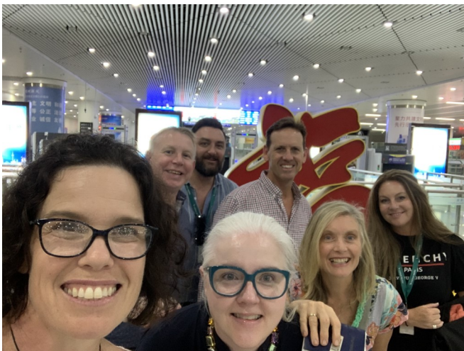
Shenzhen High Speed Train Station

Taking a trip to Shenzhen from Hong Kong is a mere 14 minute high speed train journey, with speeds reaching 198km/hr. The sales team spent the day in Shenzhen meeting with the Cathay team there, admiring the ultra-modern city and office. With over 86 million people in the Greater Bay Area it is an important part of Cathay Pacific's market.